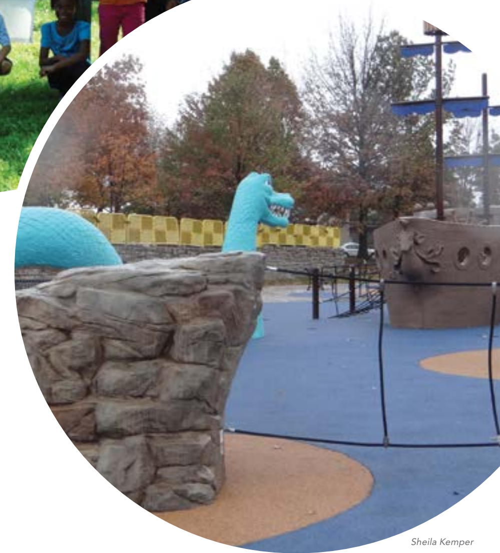
Sheila Kemper Dietrich Park