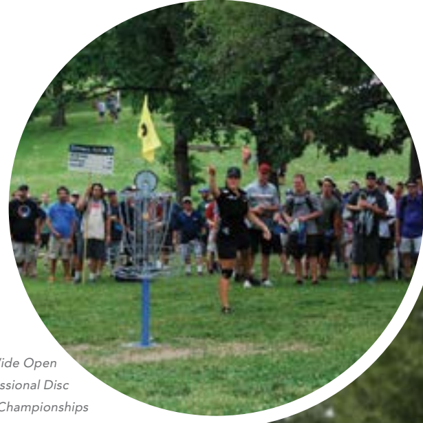
KC Wide Open Professional Disc Golf Championships

Noble Park Lighting, Trail & Bridge repairs Red Bridge Art Panel Installation Swope Park Off-Leash Dog Park Swope Park Signage Phase I Troost Lake Lighting Vineyard Gardens Drainage Improvements Westwood Park Lighting