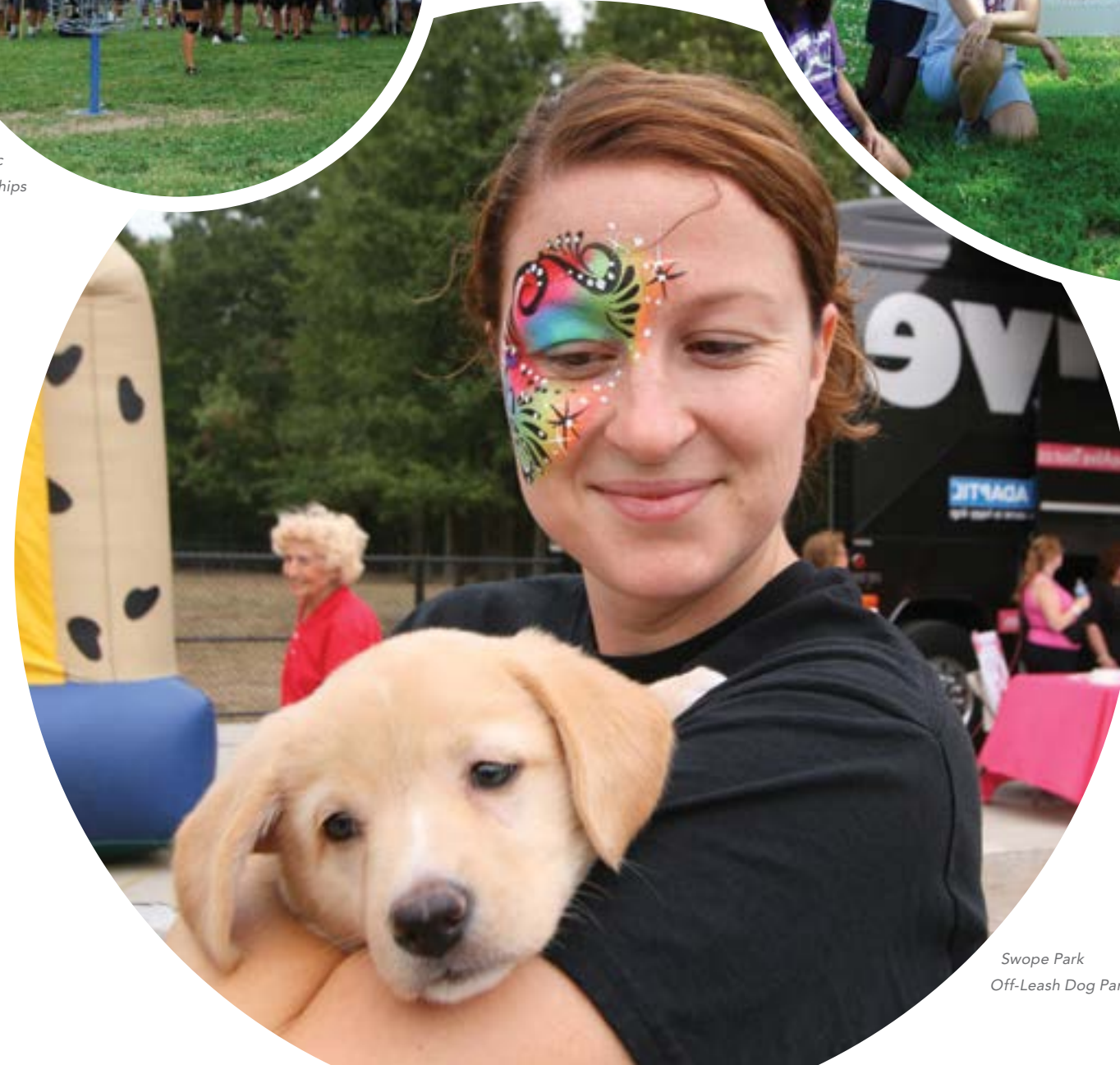
Swope Park Off-Leash Dog Park