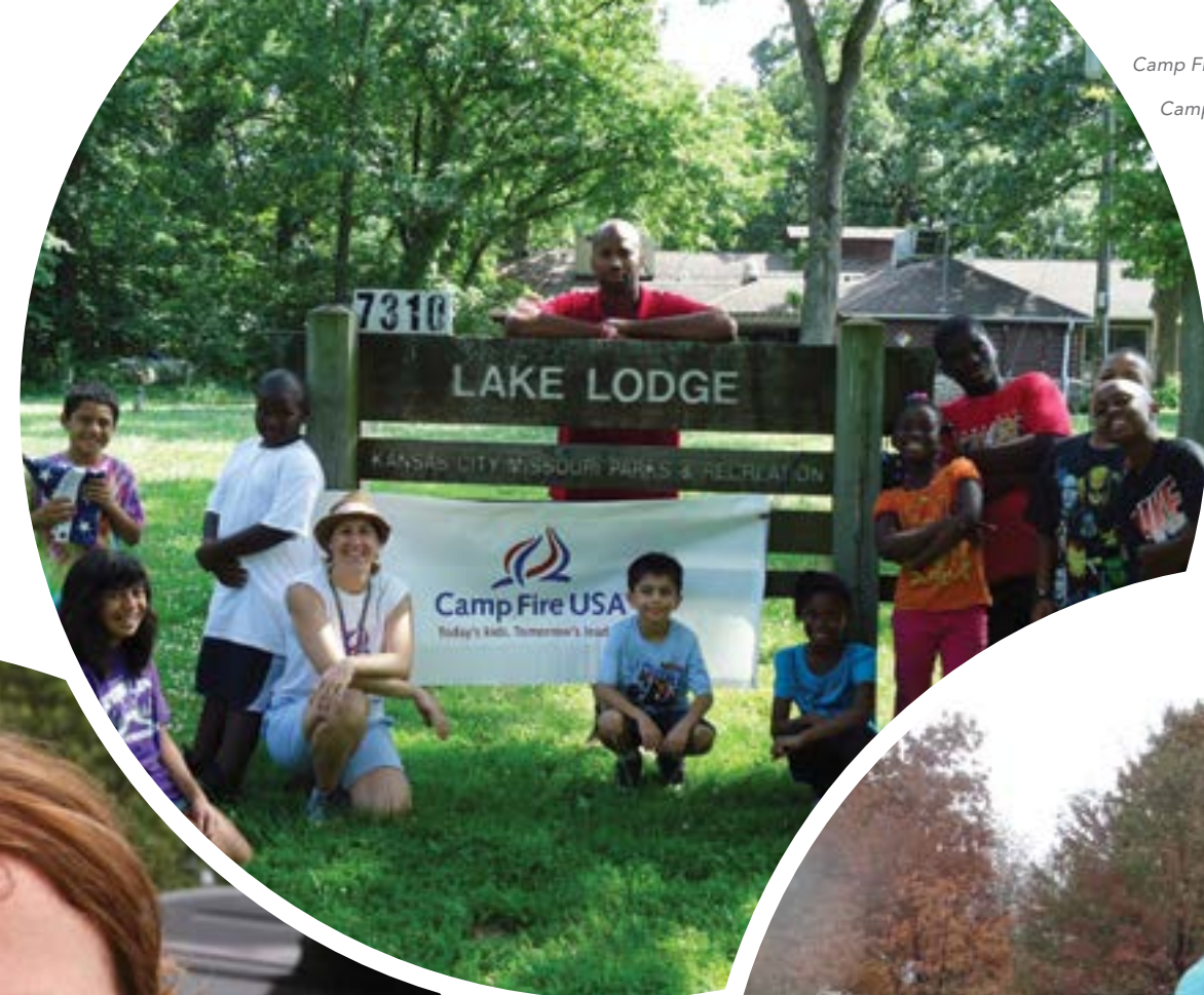
Camp Fire Heartland at Camp Lake of the Woods