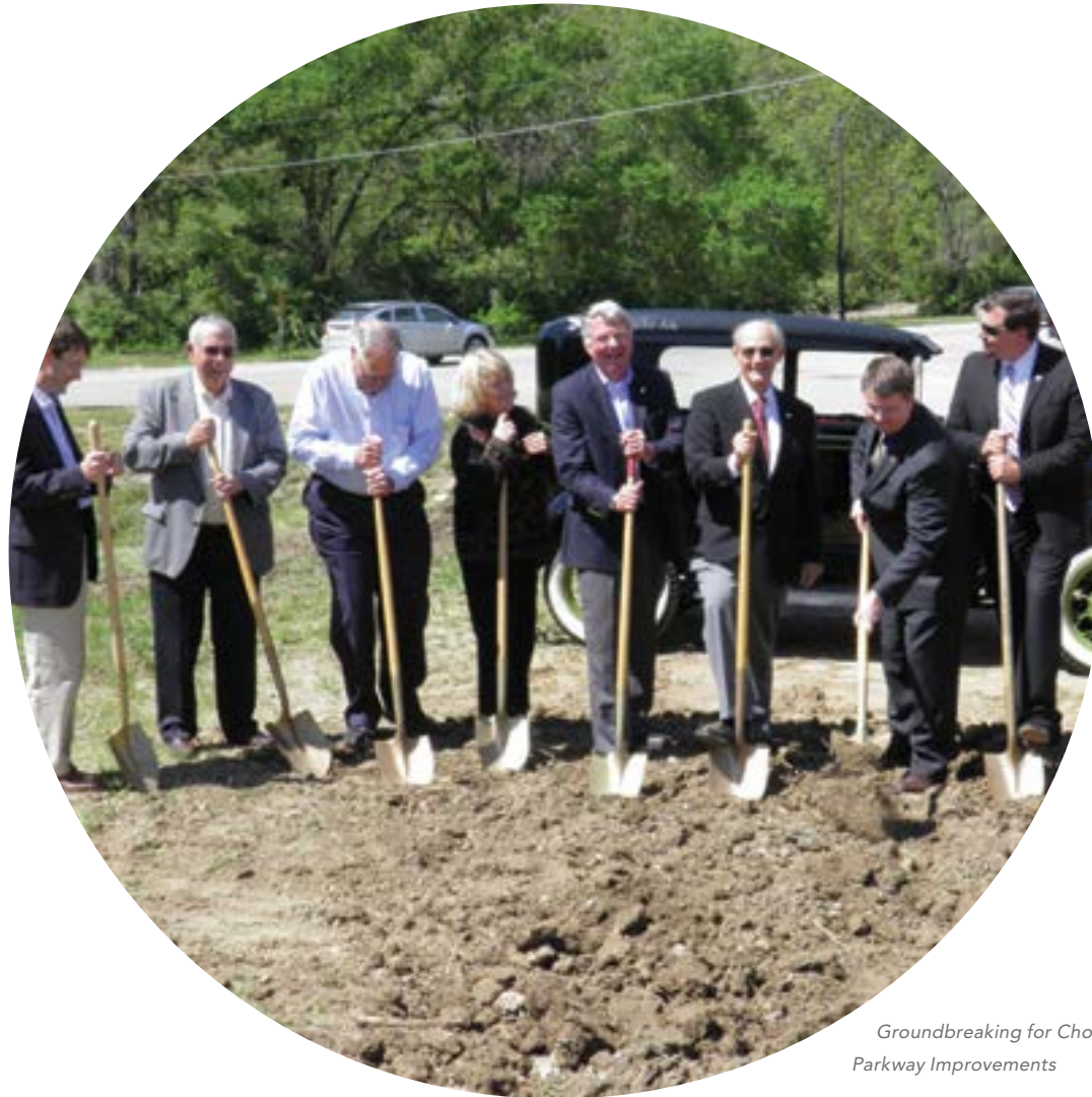
Groundbreaking for Chouteau Parkway Improvements